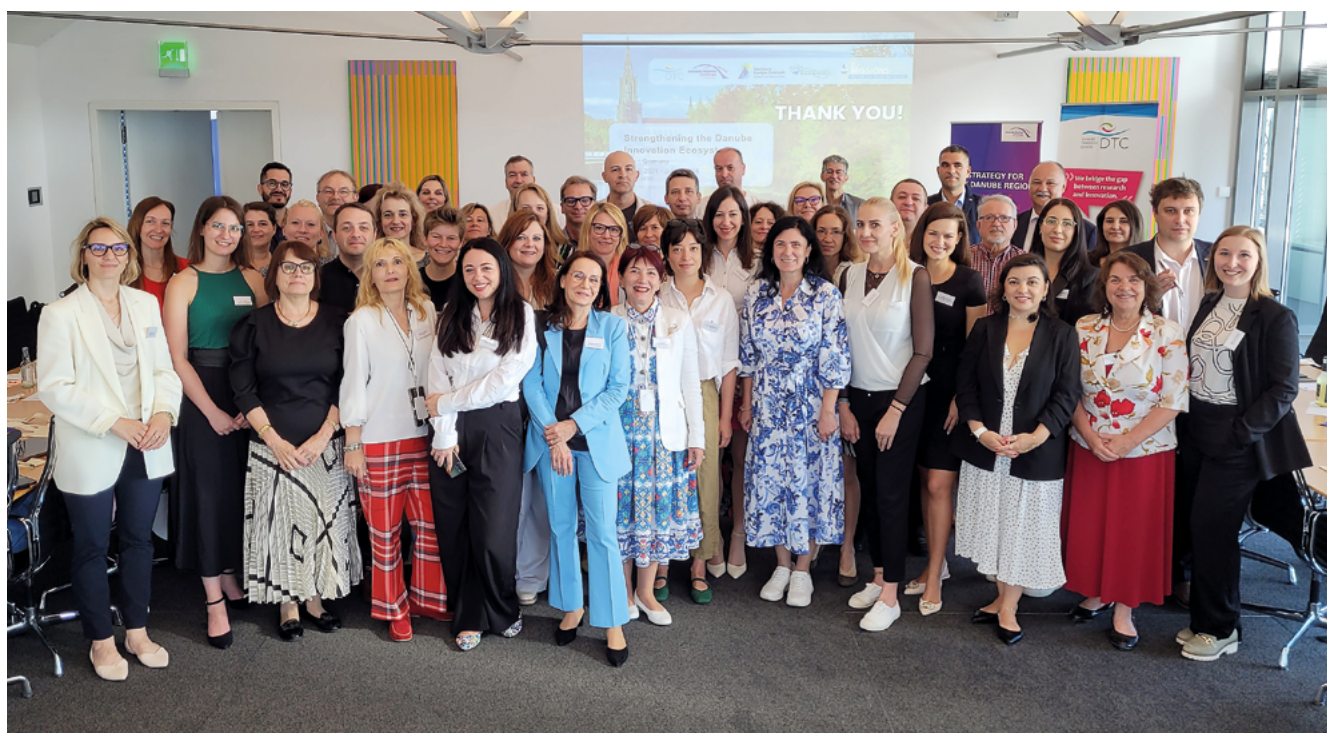
Figure 3. Participants of the workshop 'Strengthening the Danube Innovation Ecosystem' in Ulm, Germany, organized by EcoDaLLi in cooperation with Priority Area 8, Competitiveness of Enterprises, of the EU Strategy for the Danube Region.

ization of climatically valuable wetlands. SUNDANSE and iNNO SED both focus on sediment management in the Danube & Black Sea basin. EcoDaLLi as a CSA works closely not only with the other Lighthouse areas and associated projects, but also with all key stakeholders and governance structures relevant to the Mission. The projects are funded by the EU with a total of 52.3 million euros under Horizon Europe.